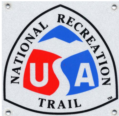
NRT markers appear on "trails that connect people to nature, to each other and to our shared histories and cultures."

In an announcement this month, the U.S. Secretary of the Interior designated 262 miles of the Ozark Trail as a National Recreation Trail . The 360 total miles of the Ozark Trail pass through some of the most scenic areas in the Ozarks and include 225 miles of contiguous through-trail. The trail stretches from Crawford County, near Steeleville to Howell County, near West Plains, Missouri. When completed Ozark Trail is anticipated to begin in St. Louis and connect with the Ozark Highlands Trail at Fort Smith, Arkansas, for an estimated 700 total miles.